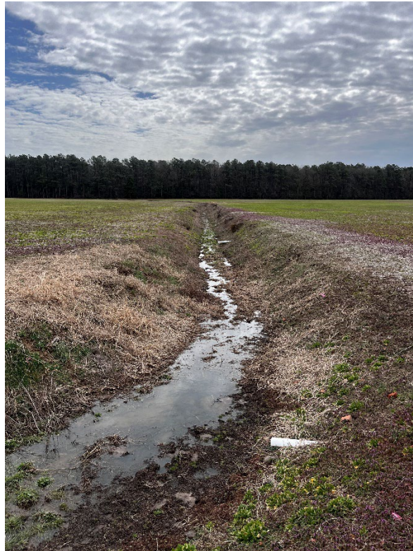
Figure 7: Non-jurisdictional agricultural ditch located in the agricultural field.

SUBJECT: 2023 Rule, as amended, Approved Jurisdictional Determination in Light of Sackett v. EPA , 143 S. Ct. 1322 (2023), NAB-2024-00577-M53