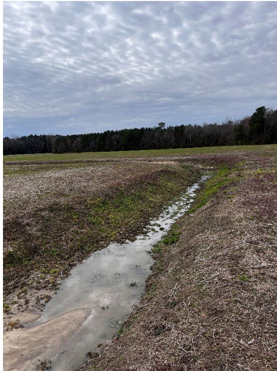
Figure 5: Non-jurisdictional agricultural ditch located in the agricultural field.

SUBJECT: 2023 Rule, as amended, Approved Jurisdictional Determination in Light of Sackett v. EPA , 143 S. Ct. 1322 (2023), NAB-2024-00577-M53