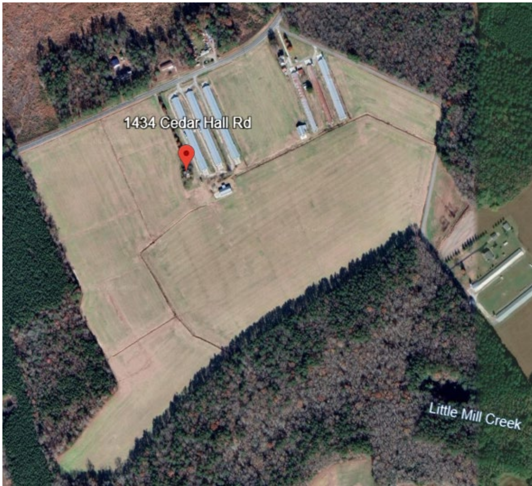
Figure 1: Vicinity Map

SUBJECT: 2023 Rule, as amended, Approved Jurisdictional Determination in Light of Sackett v. EPA , 143 S. Ct. 1322 (2023), NAB-2024-00577-M53