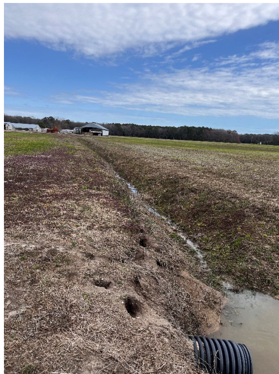
Figure 6: Non-jurisdictional agricultural ditch located in the agricultural field.