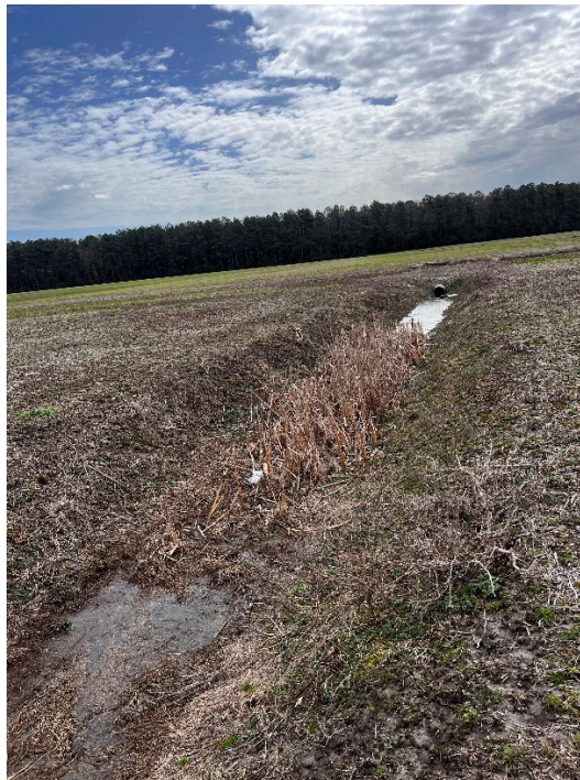
Figure 4: Non-jurisdictional agricultural ditch located in the agricultural field.