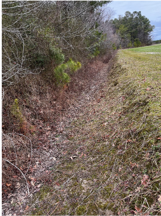
Figure 9: Non-jurisdictional agricultural ditch running alongside the tree line.

SUBJECT: 2023 Rule, as amended, Approved Jurisdictional Determination in Light of Sackett v. EPA , 143 S. Ct. 1322 (2023), NAB-2024-00577-M53