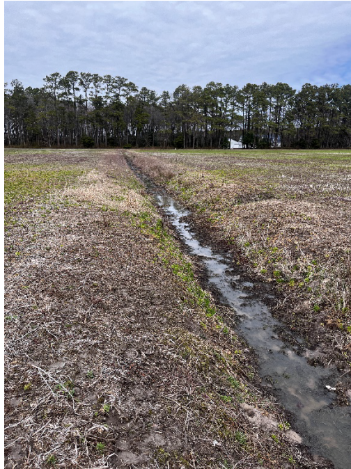
Figure 3: Non-jurisdictional agricultural ditch located in the agricultural field.

SUBJECT: 2023 Rule, as amended, Approved Jurisdictional Determination in Light of Sackett v. EPA , 143 S. Ct. 1322 (2023), NAB-2024-00577-M53