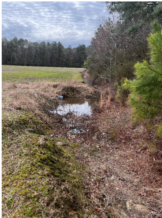
Figure 10: Non-jurisdictional agricultural ditch running alongside the tree line.