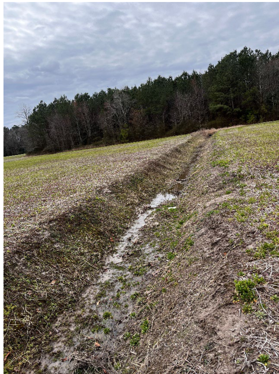
Figure 8: Non-jurisdictional agricultural ditch located in the agricultural field.